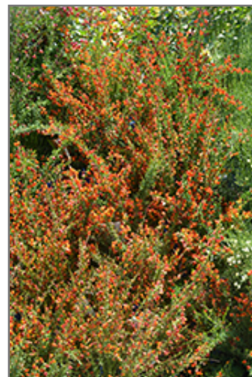
Lena Scotch Broom in bloom

This shrub should only be grown in full sunlight. It prefers dry to average moisture levels with very well-drained soil, and will often die in standing water. It is considered to be drought-tolerant, and thus makes an ideal choice for xeriscaping or the moisture-conserving landscape. It is particular about its soil conditions, with a strong preference for clay, alkaline soils, and is able to handle environmental salt. It is highly tolerant of urban pollution and will even thrive in inner city environments. This particular variety is an interspecific hybrid.