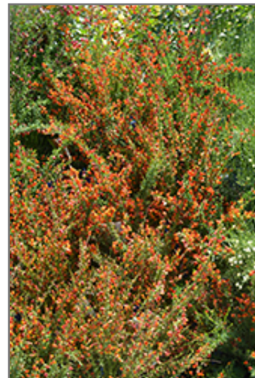
Lena Scotch Broom in bloom

This shrub should only be grown in full sunlight. It prefers dry to average moisture levels with very well-drained soil, and will often die in standing water. It is considered to be drought-tolerant, and thus makes an ideal choice for xeriscaping or the moisture-conserving landscape. It is particular about its soil conditions, with a strong preference for clay, alkaline soils, and is able to handle environmental salt. It is highly tolerant of urban pollution and will even thrive in inner city environments. This particular variety is an interspecific hybrid.