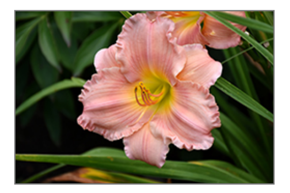
Jolyene Nichole Daylily flowers

13 Archie Street, Auburn, NY 13021 (315) 253-3030 www.dickmanfarms.com