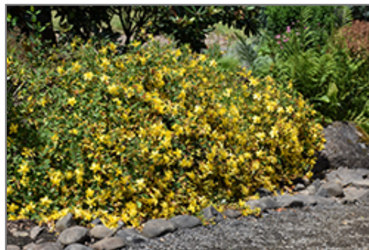
Hidcote St. John's Wort in bloom