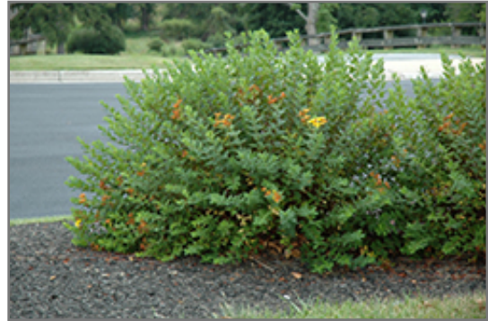
Hidcote St. John's Wort

Hidcote St. John's Wort makes a fine choice for the outdoor landscape, but it is also well-suited for use in outdoor pots and containers. With its upright habit of growth, it is best suited for use as a 'thriller' in the 'spiller-thriller-filler' container combination; plant it near the center of the pot, surrounded by smaller plants and those that spill over the edges. It is even sizeable enough that it can be grown alone in a suitable container. Note that when grown in a container, it may not perform exactly as indicated on the tag - this is to be expected. Also note that when growing plants in outdoor containers and baskets, they may require more frequent waterings than they would in the yard or garden.