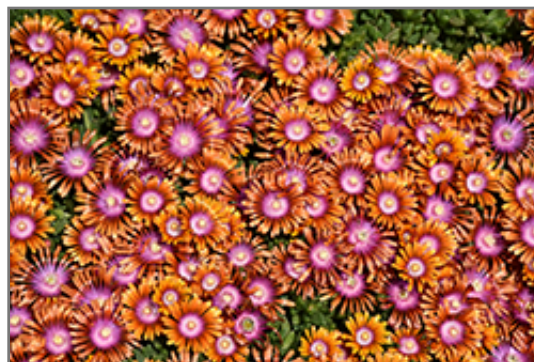
Fire Spinner Ice Plant in bloom

Fire Spinner Ice Plant is recommended for the following landscape applications;