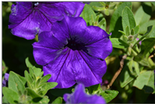
Easy Wave Blue Petunia flowers