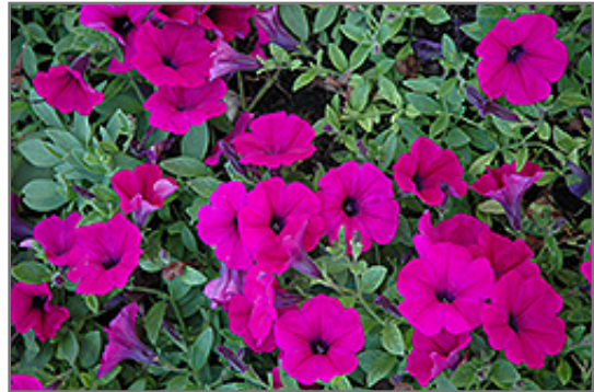
Wave Purple Classic Petunia flowers