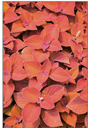
ColorBlaze Sedona Sunset Coleus foliage