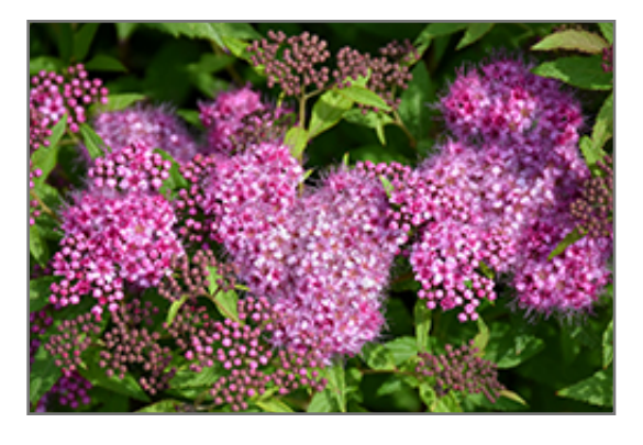
Anthony Waterer Spirea flowers