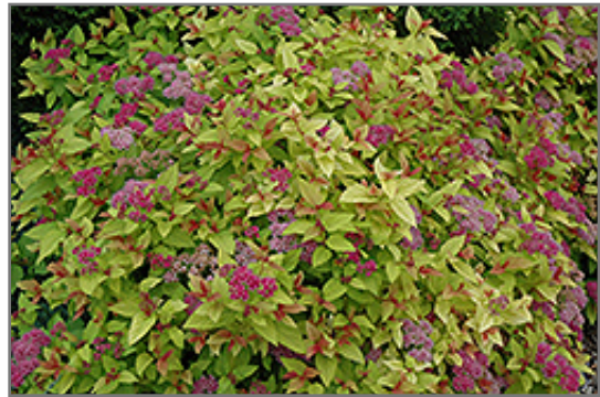
Magic Carpet Spirea flowers