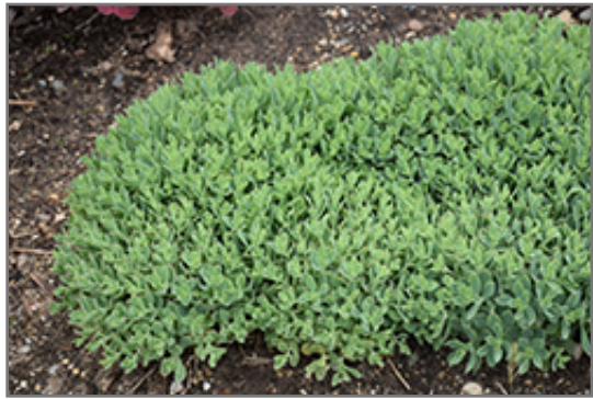
Rock 'N Round Pure Joy Stonecrop

Rock 'N Round Pure Joy Stonecrop is a fine choice for the garden, but it is also a good selection for planting in outdoor pots and containers. It is often used as a 'filler' in the 'spiller-thriller-filler' container combination, providing a mass of flowers and foliage against which the thriller plants stand out. Note that when growing plants in outdoor containers and baskets, they may require more frequent waterings than they would in the yard or garden.