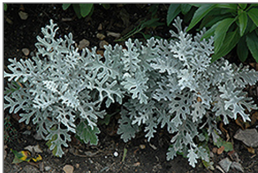
Silver Dust Dusty Miller foliage