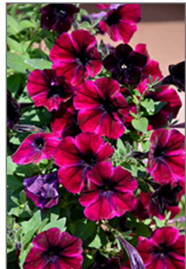
Sweetunia Johnny Flame Petunia flowers