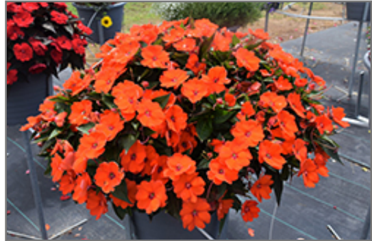
SunPatiens Compact Electric Orange New Guinea Impatiens in bloom

SunPatiens Compact Electric Orange New Guinea Impatiens is a fine choice for the garden, but it is also a good selection for planting in outdoor containers and hanging baskets. It can be used either as 'filler' or as a 'thriller' in the 'spiller-thriller-filler' container combination, depending on the height and form of the other plants used in the container planting. It is even sizeable enough that it can be grown alone in a suitable container. Note that when growing plants in outdoor containers and baskets, they may require more frequent waterings than they would in the yard or garden.