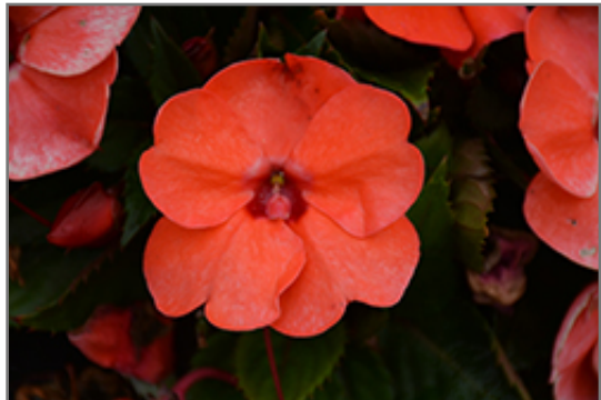
SunPatiens Compact Hot Coral New Guinea Impatiens flowers

This plant will require occasional maintenance and upkeep, and should not require much pruning, except when necessary, such as to remove dieback. It is a good choice for attracting bees and butterflies to your yard. It has no significant negative characteristics.