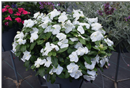
Titan Pure White Vinca in bloom

Titan Pure White Vinca will grow to be about 14 inches tall at maturity, with a spread of 12 inches. Its foliage tends to remain dense right to the ground, not requiring facer plants in front. Although it's not a true annual, this fast-growing plant can be expected to behave as an annual in our climate if left outdoors over the winter, usually needing replacement the following year. As such, gardeners should take into consideration that it will perform differently than it would in its native habitat.