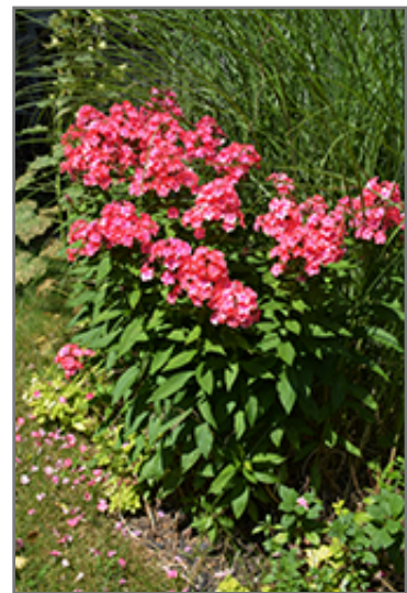
Flame Coral Garden Phlox in bloom