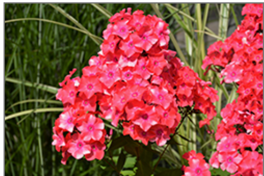
Flame Coral Garden Phlox flowers