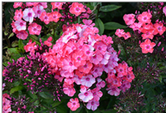
Garden Girls Glamour Girl Garden Phlox flowers

Garden Girls Glamour Girl Garden Phlox is recommended for the following landscape applications;