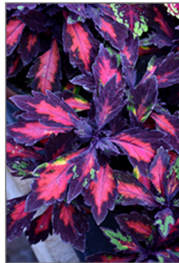
Marquee Special Effects Coleus foliage

Marquee Special Effects Coleus is recommended for the following landscape applications;