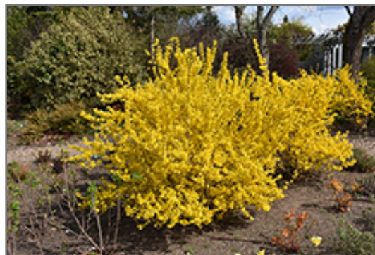
Magical Gold Forsythia in bloom