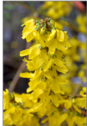
Magical Gold Forsythia flowers

Magical Gold Forsythia makes a fine choice for the outdoor landscape, but it is also well-suited for use in outdoor pots and containers. Because of its height, it is often used as a 'thriller' in the 'spiller-thriller-filler' container combination; plant it near the center of the pot, surrounded by smaller plants and those that spill over the edges. It is even sizeable enough that it can be grown alone in a suitable container. Note that when grown in a container, it may not perform exactly as indicated on the tag - this is to be expected. Also note that when growing plants in outdoor containers and baskets, they may require more frequent waterings than they would in the yard or garden.