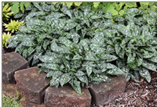
Twinkle Toes Lungwort

Twinkle Toes Lungwort is a fine choice for the garden, but it is also a good selection for planting in outdoor pots and containers. It is often used as a 'filler' in the 'spiller-thriller-filler' container combination, providing a mass of flowers and foliage against which the thriller plants stand out. Note that when growing plants in outdoor containers and baskets, they may require more frequent waterings than they would in the yard or garden.