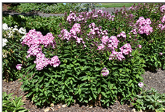
Volcano Pink with White Eye Garden Phlox in bloom