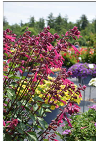
Skyscraper Dark Purple Salvia flowers

Skyscraper Dark Purple Salvia is an herbaceous annual with an upright spreading habit of growth. Its relatively fine texture sets it apart from other garden plants with less refined foliage.