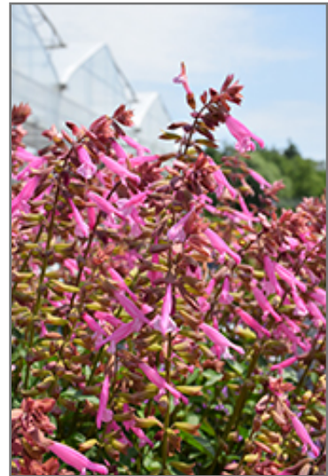
Skyscraper Pink Salvia flowers

Skyscraper Pink Salvia is an herbaceous annual with an upright spreading habit of growth. Its relatively fine texture sets it apart from other garden plants with less refined foliage.