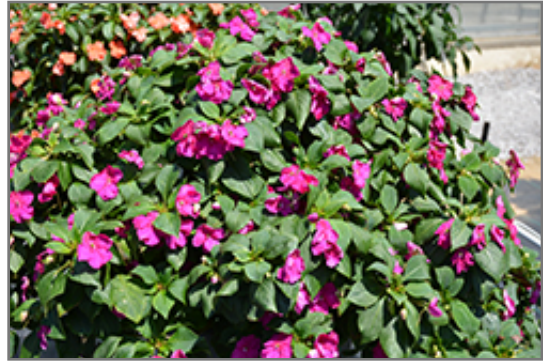
Beacon Violet Shades Impatiens in bloom

Beacon Violet Shades Impatiens will grow to be about 15 inches tall at maturity, with a spread of 12 inches. When grown in masses or used as a bedding plant, individual plants should be spaced approximately 8 inches apart. Its foliage tends to remain dense right to the ground, not requiring facer plants in front. This fast-growing annual will normally live for one full growing season, needing replacement the following year.