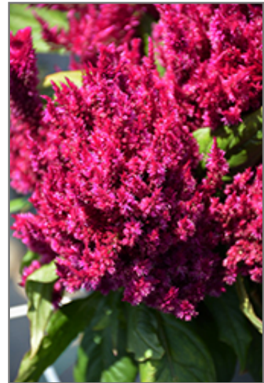
First Flame Purple Celosia flowers

First Flame Purple Celosia is recommended for the following landscape applications;