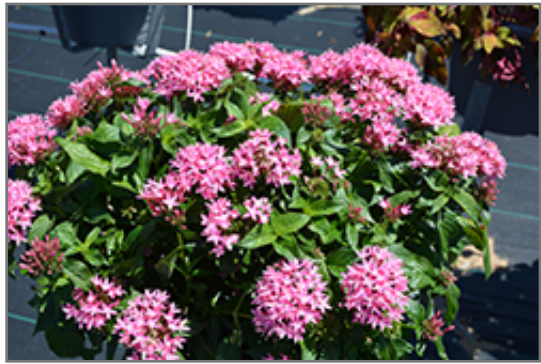
Lucky Star Deep Pink Star Flower in bloom

Lucky Star Deep Pink Star Flower will grow to be about 12 inches tall at maturity, with a spread of 14 inches. When grown in masses or used as a bedding plant, individual plants should be spaced approximately 10 inches apart. Its foliage tends to remain dense right to the ground, not requiring facer plants in front. This fast-growing annual will normally live for one full growing season, needing replacement the following year.