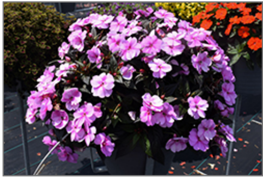
SunPatiens Vigorous Lavender Splash New Guinea Impatiens in bloom

SunPatiens Vigorous Lavender Splash New Guinea Impatiens is a fine choice for the garden, but it is also a good selection for planting in outdoor containers and hanging baskets. Because of its height, it is often used as a 'thriller' in the 'spiller-thriller-filler' container combination; plant it near the center of the pot, surrounded by smaller plants and those that spill over the edges. It is even sizeable enough that it can be grown alone in a suitable container. Note that when growing plants in outdoor containers and baskets, they may require more frequent waterings than they would in the yard or garden.