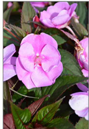
SunPatiens Vigorous Lavender Splash New Guinea Impatiens flowers