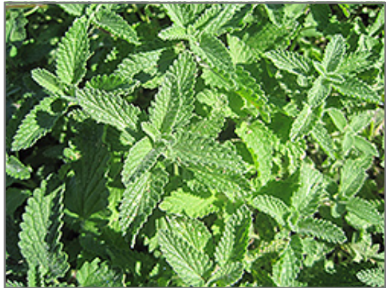
Walker's Low Catmint foliage

Walker's Low Catmint is a fine choice for the garden, but it is also a good selection for planting in outdoor pots and containers. It is often used as a 'filler' in the 'spiller-thriller-filler' container combination, providing a mass of flowers against which the thriller plants stand out. Note that when growing plants in outdoor containers and baskets, they may require more frequent waterings than they would in the yard or garden.