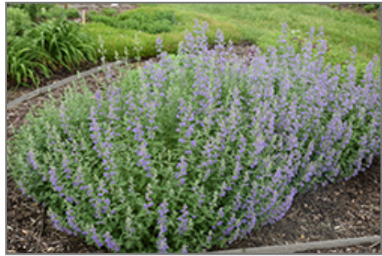
Walker's Low Catmint in bloom