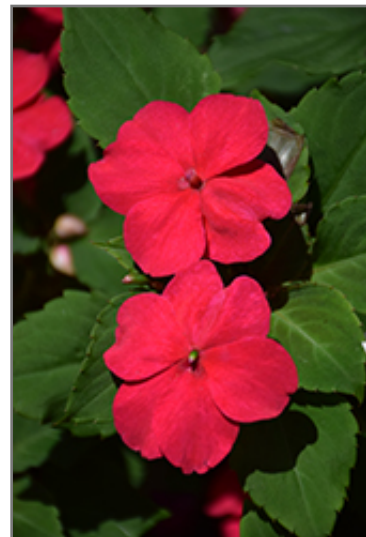
Imara XDR Rose Impatiens flowers

Imara XDR Rose Impatiens is recommended for the following landscape applications;