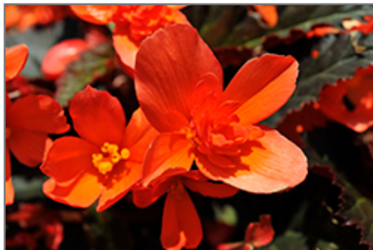
I'Conia Upright Fire Begonia flowers

I'Conia Upright Fire Begonia is recommended for the following landscape applications;