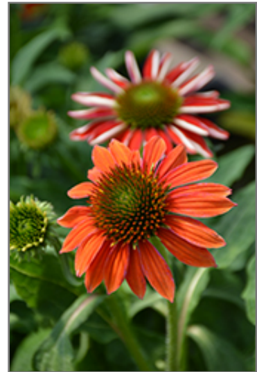
Artisan Red Ombre Coneflower flowers

Artisan Red Ombre Coneflower is recommended for the following landscape applications;