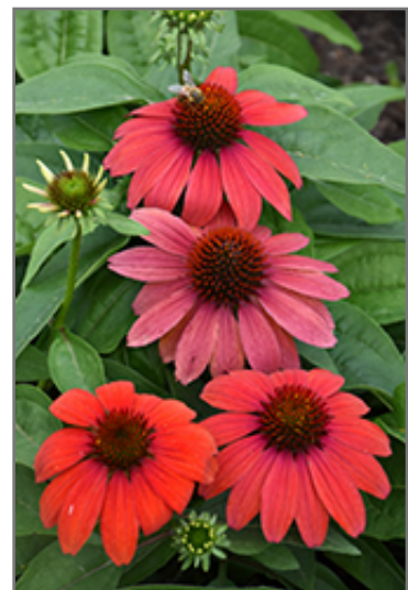
Artisan Red Ombre Coneflower flowers