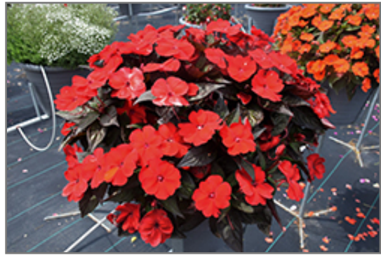
SunPatiens Compact Deep Red Impatiens in bloom

SunPatiens Compact Deep Red Impatiens is a fine choice for the garden, but it is also a good selection for planting in outdoor containers and hanging baskets. It can be used either as 'filler' or as a 'thriller' in the 'spiller-thriller-filler' container combination, depending on the height and form of the other plants used in the container planting. It is even sizeable enough that it can be grown alone in a suitable container. Note that when growing plants in outdoor containers and baskets, they may require more frequent waterings than they would in the yard or garden.