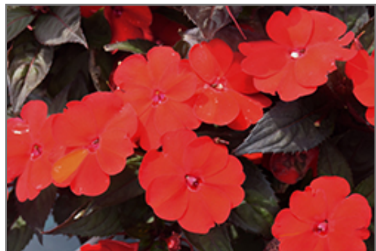
SunPatiens Compact Deep Red Impatiens flowers