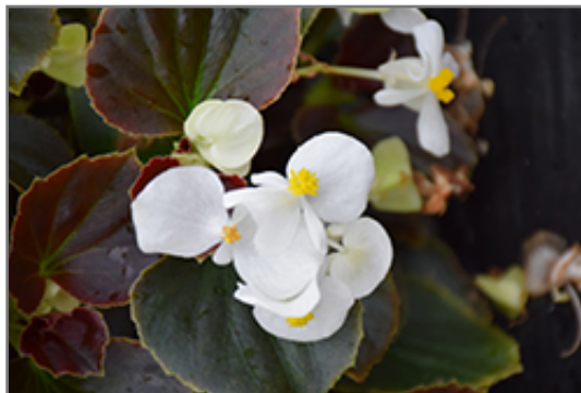
Eureka Bronze Leaf White Begonia flowers