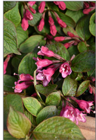
Midnight Sun Reblooming Weigela flowers

Midnight Sun Reblooming Weigela makes a fine choice for the outdoor landscape, but it is also well-suited for use in outdoor pots and containers. It is often used as a 'filler' in the 'spiller-thriller-filler' container combination, providing a mass of flowers and foliage against which the thriller plants stand out. Note that when grown in a container, it may not perform exactly as indicated on the tag - this is to be expected. Also note that when growing plants in outdoor containers and baskets, they may require more frequent waterings than they would in the yard or garden.