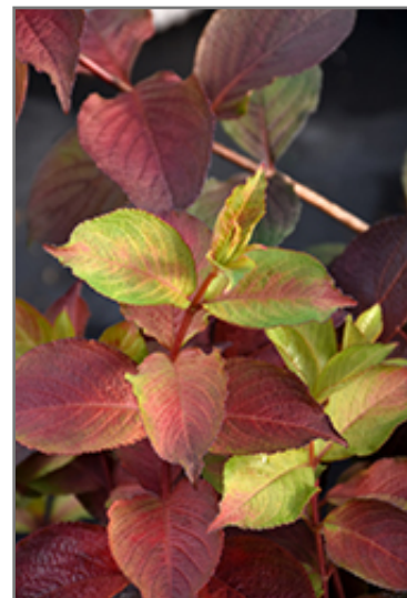
Midnight Sun Reblooming Weigela foliage