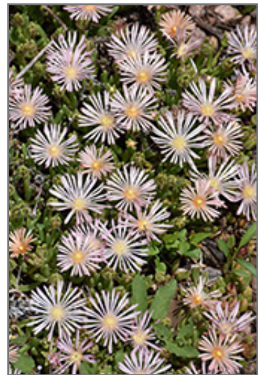
Alan's Apricot Ice Plant flowers