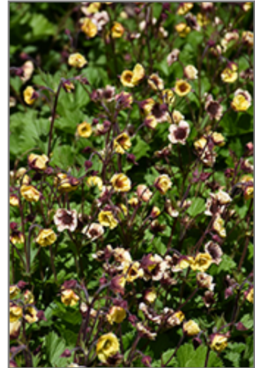
Tempo Yellow Avens flowers

Tempo Yellow Avens is recommended for the following landscape applications;