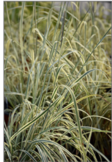
Shining Star Bluestem foliage

Shining Star Bluestem is recommended for the following landscape applications;