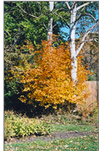
Saskatoon in fall