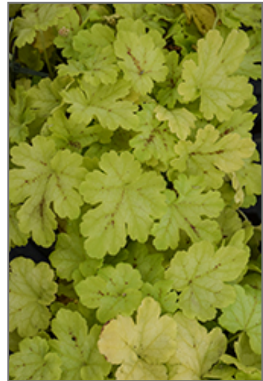
Spicy Lime Foamy Bells foliage

Spicy Lime Foamy Bells is recommended for the following landscape applications;