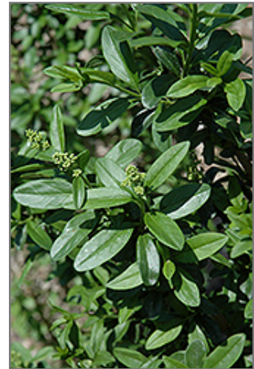
California Privet foliage