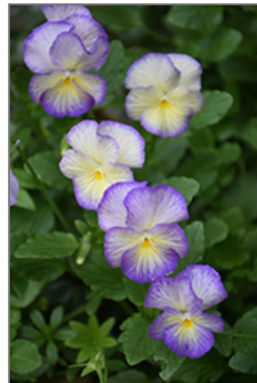
Etain Pansy flowers