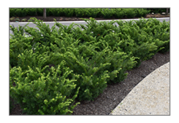
Densiformis Yew

Densiformis Yew is a dense multi-stemmed evergreen shrub with an upright spreading habit of growth. Its relatively fine texture sets it apart from other landscape plants with less refined foliage.