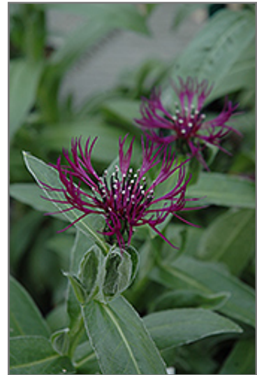
Amethyst Dream Cornflower flowers