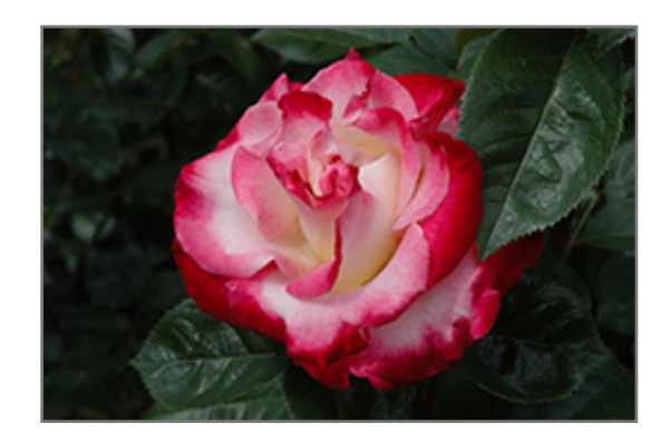
Dick Clark Rose flowers

13 Archie Street, Auburn, NY 13021 (315) 253-3030 www.dickmanfarms.com