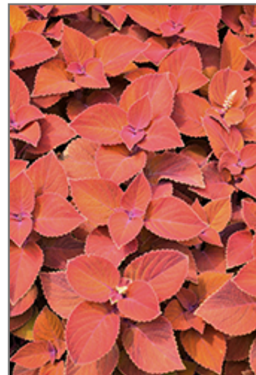
ColorBlaze Sedona Sunset Coleus foliage