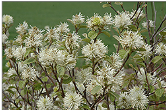
Dwarf Fothergilla flowers

This shrub does best in full sun to partial shade. It requires an evenly moist well-drained soil for optimal growth, but will die in standing water. It is not particular as to soil type, but has a definite preference for acidic soils, and is subject to chlorosis (yellowing) of the foliage in alkaline soils. It is somewhat tolerant of urban pollution. This species is native to parts of North America.