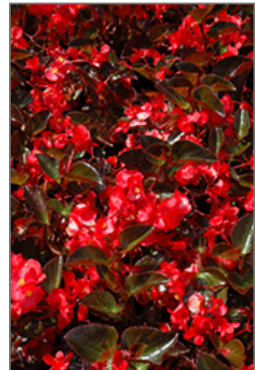
Big Red Bronze Leaf Begonia flowers