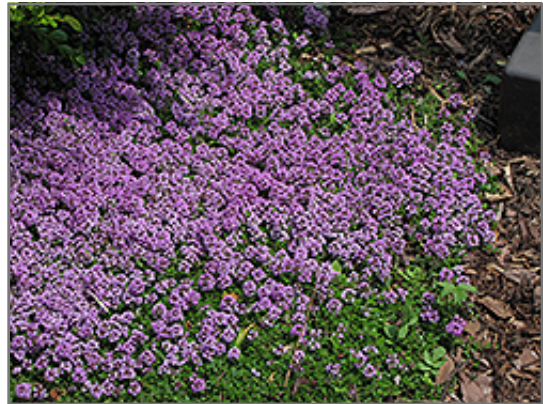
Purple Carpet Creeping Thyme in bloom