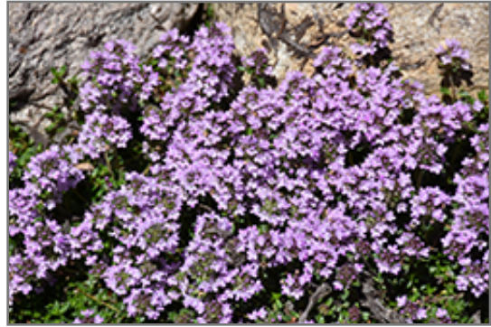
Purple Carpet Creeping Thyme flowers