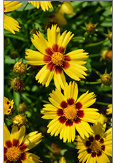
Sunkiss Tickseed flowers