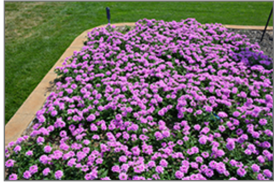
EnduraScape Pink Bicolor Verbena in bloom

EnduraScape Pink Bicolor Verbena is a fine choice for the garden, but it is also a good selection for planting in outdoor containers and hanging baskets. Because of its trailing habit of growth, it is ideally suited for use as a 'spiller' in the 'spiller-thriller-filler' container combination; plant it near the edges where it can spill gracefully over the pot. Note that when growing plants in outdoor containers and baskets, they may require more frequent waterings than they would in the yard or garden.