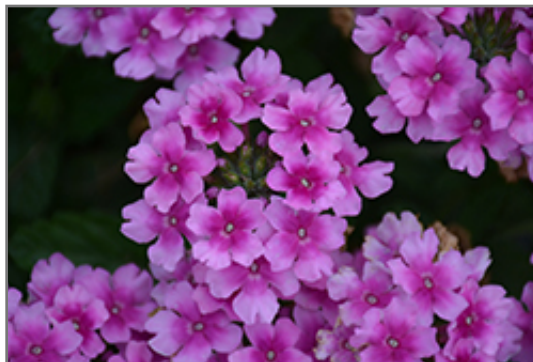
EnduraScape Pink Bicolor Verbena flowers

This plant will require occasional maintenance and upkeep. Trim off the flower heads after they fade and die to encourage more blooms late into the season. Deer don't particularly care for this plant and will usually leave it alone in favor of tastier treats. It has no significant negative characteristics.